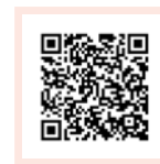
Formulaire en FR