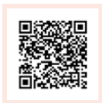
Formular auf DE

The information collected in this application form is necessary in order to proceed with your request for the "Application for a grant - Technical devices".