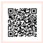
Formulaire en FR