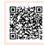
Formulaire en FR