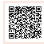
Formular auf DE